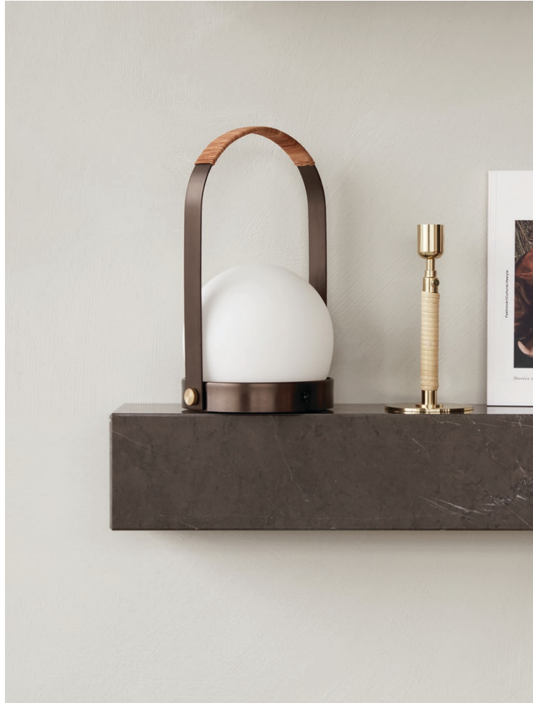
CARRIE TABLE LAMP Designed by Norm Architects